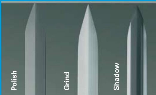
10mm Aurora V-Groove finishes.