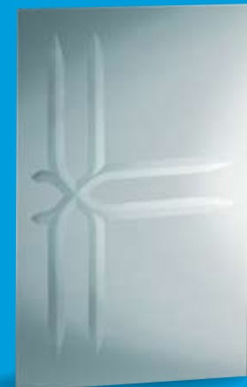
Examples of Aurora V-Groove curved and ornamental patterns.